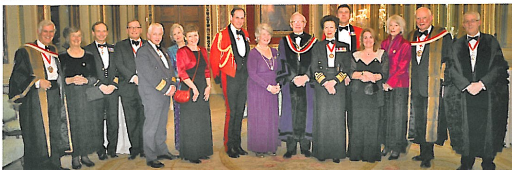
HRH the Princess Royal, Master, Wardens, Clerk, Awards chairman, military Assistants and wives at Drapers' Hall