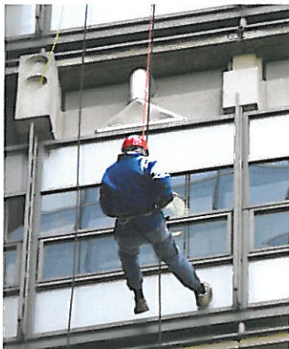
The Master abseils down Lloyds of London to raise funds for Treloar's

Carmen attend functions in unique venues, enjoy fine wines and fellowship, and are entertained by distinguished speakers. They rise when bid, raise glass when told, clap as required and fall silent on demand. All this because of one man's bidding: 'Master, Wardens, My Lords, ladies and gentlemen, pray silence for....' yet how many know anything about the man in the tailcoat, with the glorious red sash, the commanding tones, the thunderous gavel?